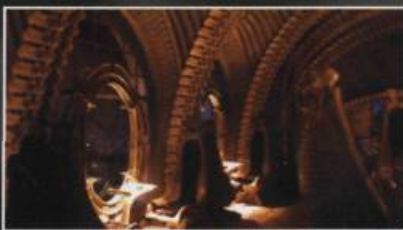
Each detail shows the master's hand

One project that had been sleeping in the "safe of ideas" of the Swiss artist for long was the implementation of a bar designed in the typical Giger style. 1988 the project was to become reality and the first HR Giger Bar with 4 floors was to open in Tokyo. Unfortunately, due to strict building legislation, many designs of the artist could not be implemented and so the bar was not licensed to use the name "HR Giger". In the meantime, the bar is closed. It took four more years until the first official Giger Bar opened in the home town of the Alien creator. We were there for the opening and saw the designs of all the rooms. Everything is made in the biomechanical