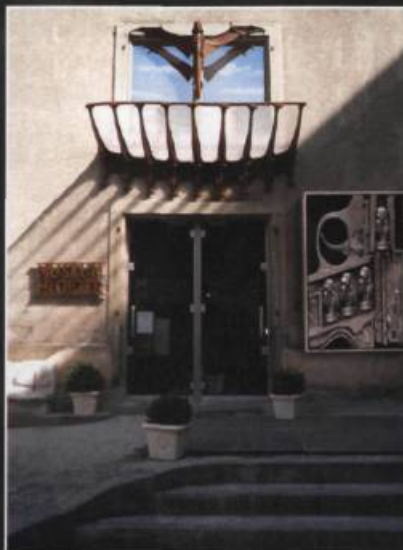
Welcome - everything looks quite nice in the bright sunlight.