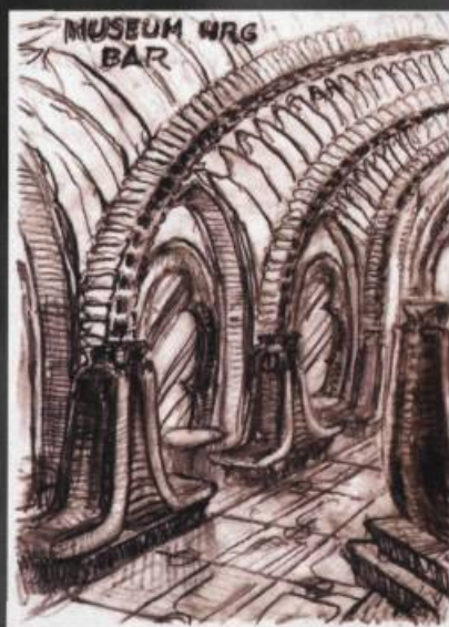
The drawing shows how the works were implemented exactly according to HR Giger's plans this time, pencil and felt pen on paper 21 x 15 cm

cal style, you feel as if you were entering another world. However, this bar was still something of a compromise, because the master had to stick to the requirements of the given facilities - and Giger wanted more.