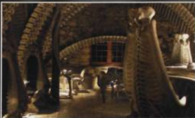
On the right side you can see the famous Harkonnen chairs - the wood framed window almost seems like a alien object