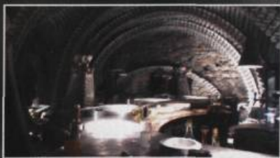
The fibre glass skeletons adapt seamlessly to the historical masonry

ated the famous Harkonnen chair, a piece of furniture that looked as if it were made out of skeletons but which could be used as a chair. The rest is history. On 14 April 1980, about 2 years after he had been given the order to work on a Science Fiction horror movie that was to become a worldwide success, HR Giger was granted