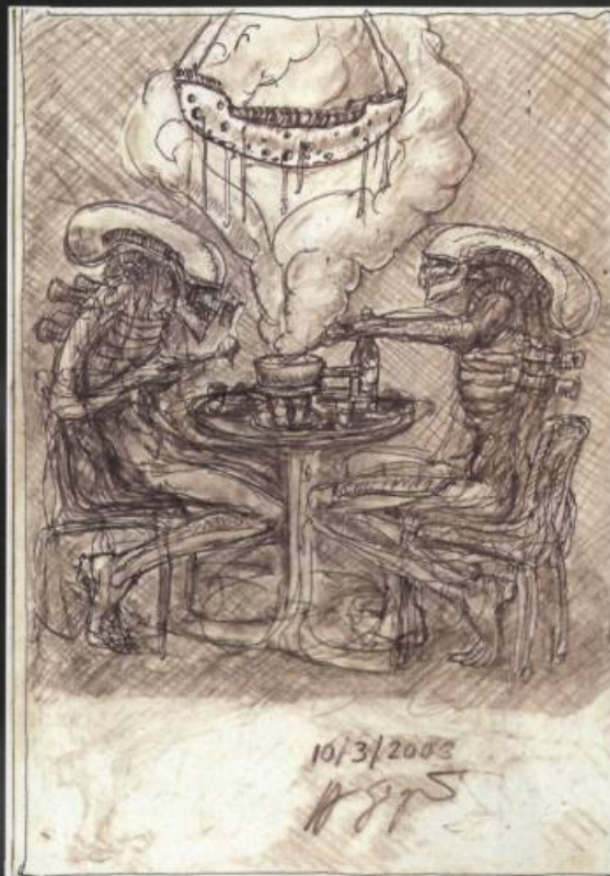
"Alien Fondue" - rather rare guests in HR Giger's bar... zinc lithography, 25 x 33.5cm, 100 copies