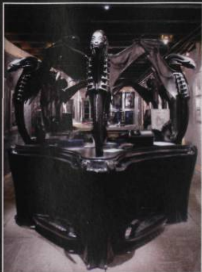
The entrance hall already gets the visitors in the mood for Giger

...but when the night falls, the true nature stands out