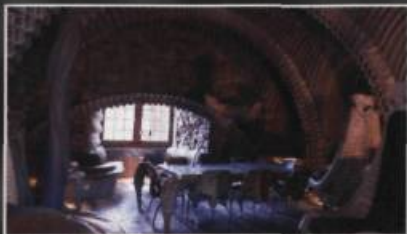
One vertebra after the other was modeled on the ceiling and adapted to the colors of the castle walls. In the background you can see Giger's Chovel Chairs of 1999 as well as one Harkonnen table with glass top