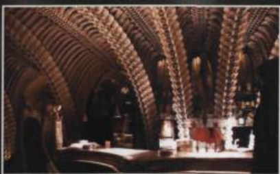
It took three years of work until this unique work of art had been finished

the Oscar in Los Angeles for "Best Achievement for Visual Effects" in the design of the "Alien" for the cult movie of the same name by director Ridley Scott - and HR Giger became a cult person himself. He did designs for Poltergeist II, Alien III and Species, the record covers for Debbie Harry and Emerson, Lake and Palmer were elected among the 100 best designs of musical history. In the meantime, his work fills almost 20 books, there are sculptures, lithographs, furniture and the designs and projects that have not been implemented yet are filling many files.