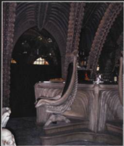
Inviting... or rather not? 8 Harkonnen chairs are standing guard at the bar

ated the famous Harkonnen chair, a piece of furniture that looked as if it were made out of skeletons but which could be used as a chair. The rest is history. On 14 April 1980, about 2 years after he had been given the order to work on a Science Fiction horror movie that was to become a worldwide success, HR Giger was granted