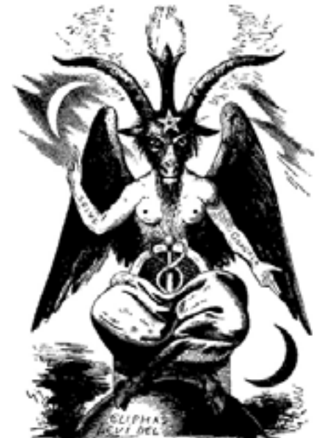
THE SABBAIC GOAT

Today, it isn't unusual for a Baphomet-like goat-headed pentagram to be hung over the altar in a Satanic church. True worshippers may also wear a Baphomet sigil as a pendant, belt buckle or tattoo and hard-core death and black metal bands have adopted Baphomet for their own artistic uses.