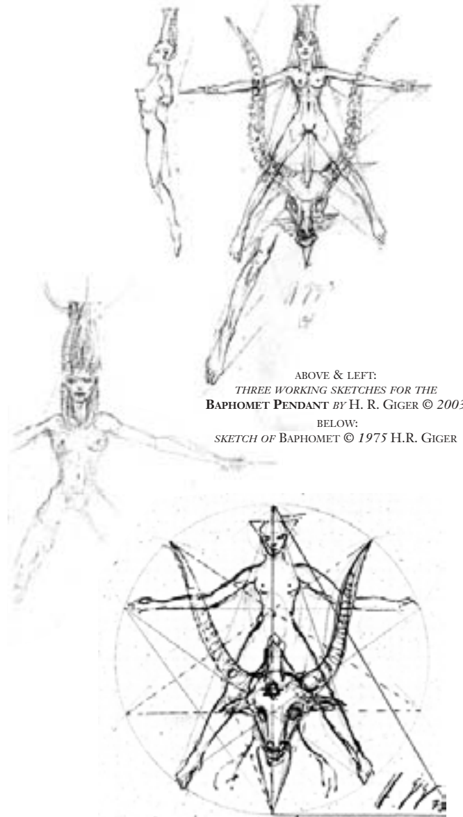
ABOVE & LEFT: THREE WORKING SKETCHES FOR THE BAPHOMET PENDANT BY H. R. GIGER © 2003 BELOW: SKETCH OF BAPHOMET © 1975 H.R. GIGER

the house is Giger-land, black on black, darkly lit, with displays of fabulous wall-size artworks, furniture and sculptures. Absolutely phenomenal. The other side of the house is relatively normal. That's where the workshop is and that's where life goes on."