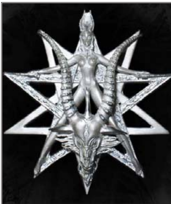
BAPHOMET PENDANT © 2004 HR GIGER BY HR GIGER & PAUL KOMODA

Levi's creation was allegorical, depicting the duality of all living things. The figure's body is both male and female with obvious breasts and a caduceus, the ancient doctor's symbol of snakes entwined around a rod, in the lap of Baphomet. Like many common demons, the creature has cloven hoofs and a goat's head. These items