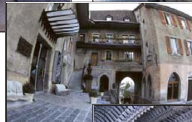
ABOVE & BELOW: THE HR GIGER MUSEUM BAR