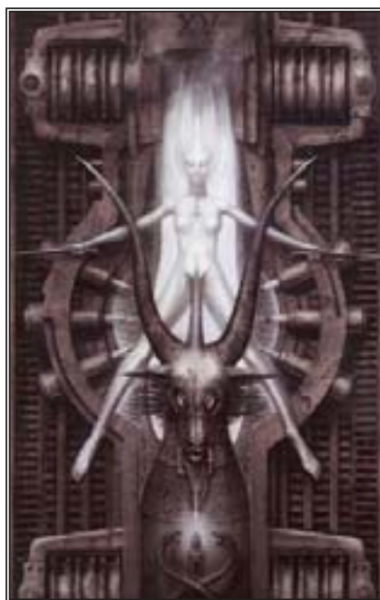
BAPHOMET (AFTER ELIPHAS LEVI) © 1975 HR GIGER, 200 X 140CM, ACRYLIC ON PAPER ON WOOD

But Akron's meanings—among others—were not his. "If somebody likes a painting, it is because he